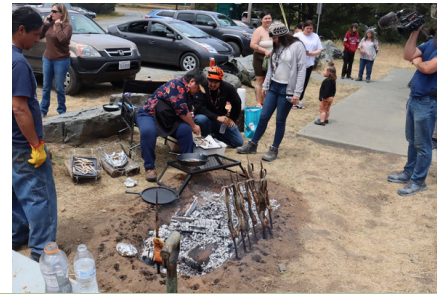
Over 100 people joined us for a hike, installation of Tolowa language signs and traditional Tolowa foods for California State Parks Week event.