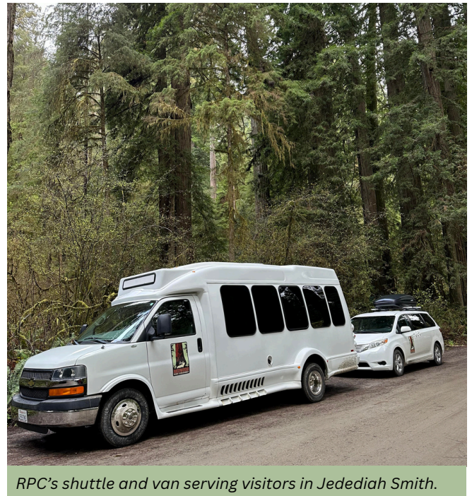
RPC's shuttle and van serving visitors in Jedediah Smith.

RPC provided transportation and volunteers for several RNSP events such as the Prairie Creek Centennial celebration, Tolowa honoring dance, G.O.A.L events, and the historic Tvm-Chaa'-me' Day which saw Tolowa traditions return to the bank of the Smith River for the first time in over 100 years.