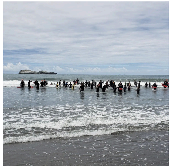
The Junior Lifeguards help make our coast safer.

Redwood Parks Conservancy secured a grant from the Coastal Conservancy to support the Junior Lifeguards program in 2023 through 2024. The Junior Lifeguards program teaches children about safety in coastal waters. They learn CPR, first aid, and rescue skills, along with playing fun games and swimming. The Junior Lifeguards program is inclusive of all abilities and offers scholarships to children who need them. The grant helps to fund the scholarships, along with equipment and supplies for the program.